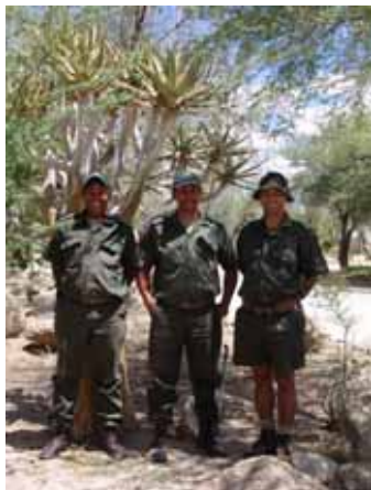
Fig 7: Augrabies Rangers

I would therefore like to send out a heart-felt THANK YOU on behalf of myself, SANParks researchers, park managers, section rangers and field rangers, to everyone who generously donated (big or small) to the SANParks CyberTracker initiative over the past year. Without your help, none of this would be possible. Our next goal is to expand the project further to equip the rest of SANParks and perhaps increase the number of units per Park.