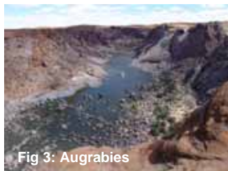
Fig 3: Augrabies

These devices are used to collect field information for effective environmental management and research. CyberTracker ( www.cybertracker.org ) software is customised for each National Park in order to facilitate park-specific monitoring e.g. important field observations in Mapungubwe might include aardvark and cultural sites while Krugers' may contain elephants and baobabs (see Fig 1 for screenshot of an animal sightings page from Mapungubwe's CyberTracker program).