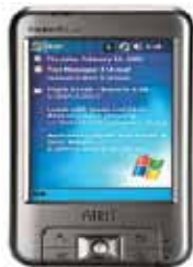
Fig 1: AIRIS T620

The SANParks' CyberTracker Program (see http://www.sanparks.org/parks/kruger/conservation/scientific/gis/cybertracker.php ) will be operational in most National Parks by the end