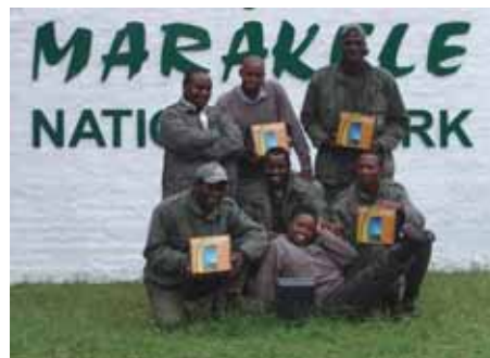
Fig 4: Marakele Rangers