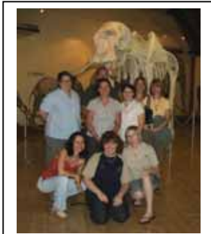
Fig 6: A-List Birders

These donations were further encouraged by the creative fund raising initiatives (Operation Duke; “A”-List Birders Weekend; Cricket@Skukuza and more) of the SANParks forum moderators and members ( http://www.sanparks.org/forums/ ) who not only generously offer their money but also their valuable time in aid of conservation.