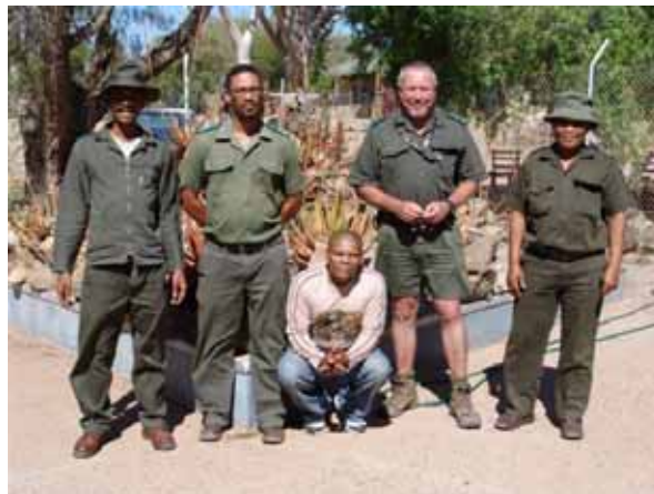
Fig 8: Richtersveld Rangers