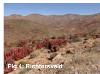
Fig 4: Richtersveld

These devices are used to collect field information for effective environmental management and research. CyberTracker ( www.cybertracker.org ) software is customised for each National Park in order to facilitate park-specific monitoring e.g. important field observations in Mapungubwe might include aardvark and cultural sites while Krugers' may contain elephants and baobabs (see Fig 1 for screenshot of an animal sightings page from Mapungubwe's CyberTracker program).