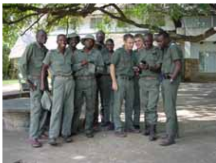
Fig 4: Mapungubwe Rangers